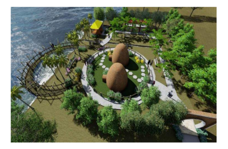
Figure 2. Development Plan for Remaining Charcoal Kitchen Building (Above View)

Tourism village is very much needed. The form of packaging for the rest of the charcoal kitchen building can be packaged as shown in the following pictures: