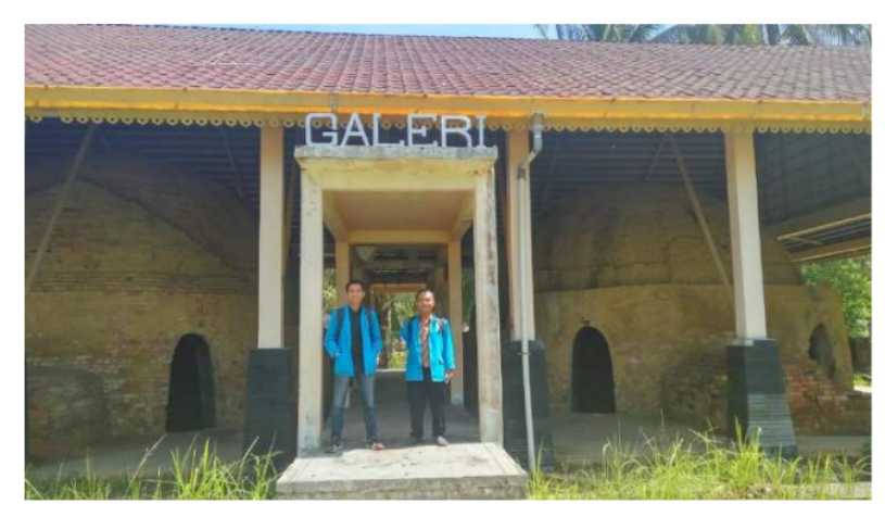
Figure 2. The Bintan Regency Government carries out conservation by building protective buildings

The charcoal kitchen is not only found in Kuala Sempang Village but there are several other locations, one of which is in Panglong Village. In carrying out conservation, the Bintan Regency Government carries out conservation by building protective buildings as shown below: