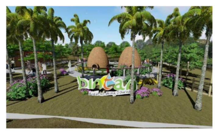
Figure 3. Development Plan for Remaining Charcoal Kitchen Building (Front View)