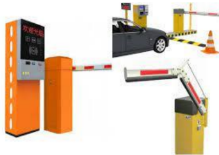
Table 2. Electronic parking transaction

Electronic parking transaction could be described ( Electronic Parking System Singapore | Full & Semi EPS System , n.d.) 2 :