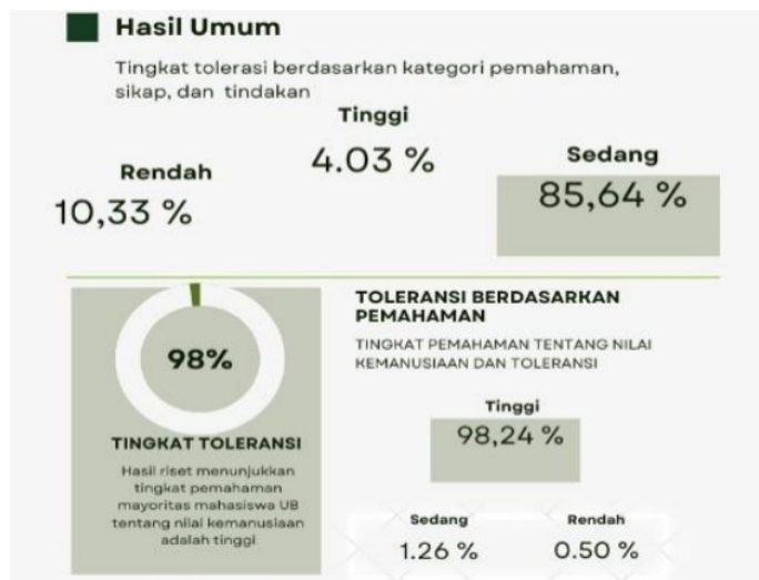
Figures 2. The results of the research on the level of understanding of respondents of University Brawijaya students

In addition, SETARA Institute has also been actively conducting research to measure the Tolerant City Index (IKT) since 2015. Research on monitoring people's living conditions, especially the situation of tolerance in Indonesia, shows that the trend of tolerance at the civil society level has stagnated. In fact, not infrequently there is a decrease in the quality of appreciation and acceptance of diversity. The Legatum Institute in its Legatum Prosperity Index 2020 report places Indonesia in position 100 out of 167 countries for the Personal Freedom category, which measures the protection of basic rights, individual freedom and tolerance in society. In the previous year's index (2019), Indonesia's position was ranked 103, and ranked 115 in the 2018 index. In the Democracy Index 2020 released by the institution, Indonesia scored 5.59 (range 0-10) for the Civil Liberties category (civil liberties). (Subhi Azhari & Halili, 2020)