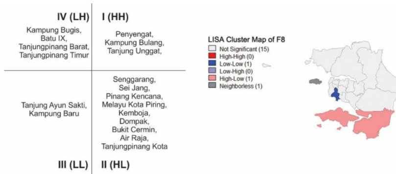
Figure 3. Moran's Scatter Plot (left) and LISA Cluster Map (Right) for B8 Behavior