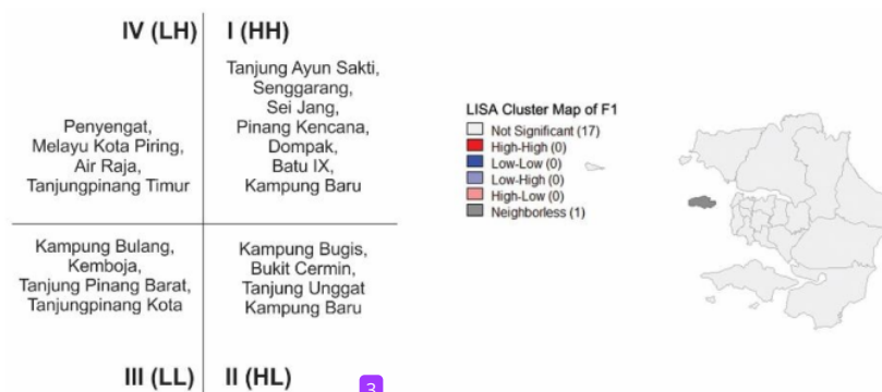
Figure 2. Moran's Scatter Plot (left) and LISA Cluster Map (Right) for B1 Behavior

Figures 2 and 3 show the LISA analysis of B1 and B8, respectively. It could be seen from Figure 2 that six kelurahan located in high-high quadrant (I (HH)), 4 in high low quadrant (II (HL)), 4 in low-low quadrant (III (LL)), and 4 in low-high quadrant (IV (LH)). However, there are no significant spatial association of kelurahan for all quadrants of B1. On the other hand, Figure 3 shows that there are significant associations of B8 in HL quadrant which centered in Dompok and in LL quadrant which is pointed in Kampung Baru.